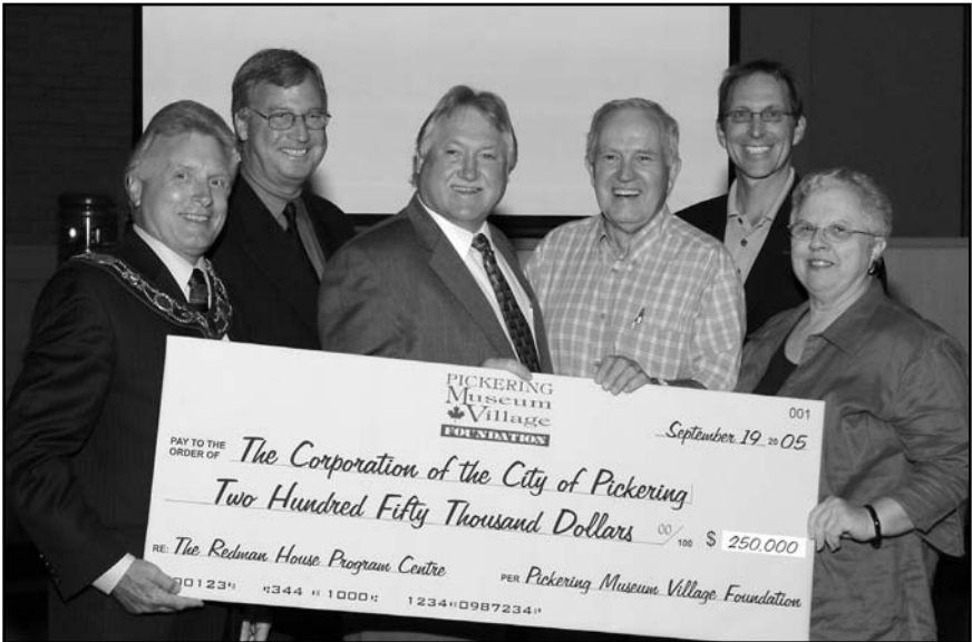
The BIG Cheque presentation